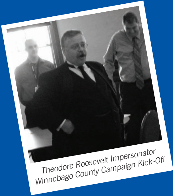
Theodore Roosevelt Impersonator Winnebago County Campaign Kick-Off