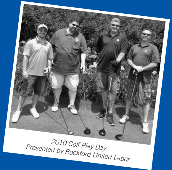
2010 Golf Play Day Presented by Rockford United Labor