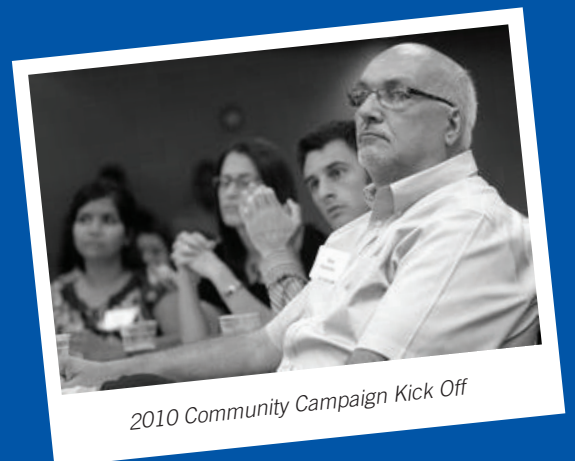
2010 Community Campaign Kick Off