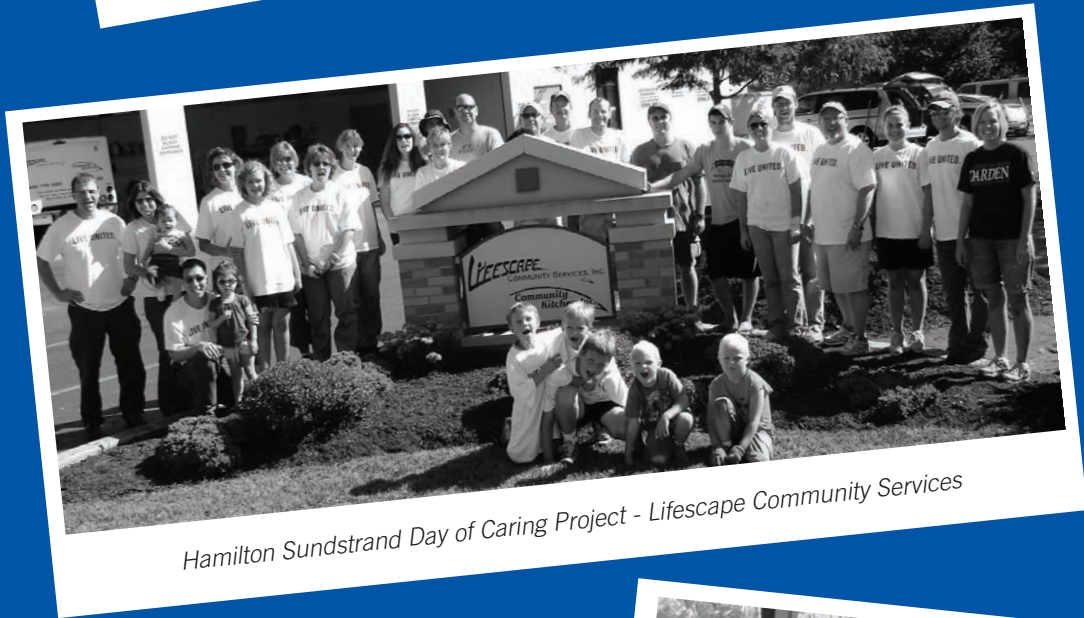
Hamilton Sundstrand Day of Caring Project - Lifescape Community Services